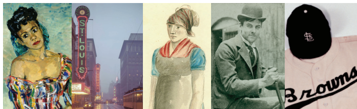
Missouri History Museum images

Organized by the Missouri History Museum